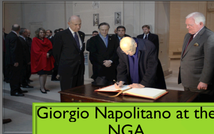
Giorgio Napolitano at the NGA